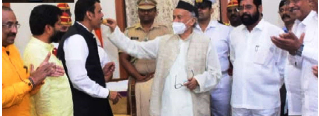
Maharashtra Governor Bhagat Singh Koshyari, CM Eknath Shinde, and DCM Devendra Fadnis during the swearing-in ceremony. (Inset: Former CM Uddhav Thackeray.